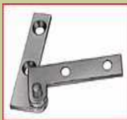
MJK AL PS Solid Brass Side Pivot Hinges (One Piece) Size : 63 mm & 69 mm