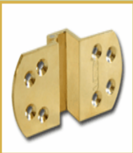
MJK AL B011 Solid Brass "W" Hinge