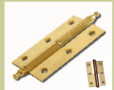
MJK AI CR Solid Brass Crown Hinge (Right Left) Size : 50 x 19 mm (2" x 3/4") 63 x 19 mm (2-1/2" x 3/4") 75 x 19 mm (3" x 3/4") 100 x 31 mm (4" x 1-1/4")

Brass Washer is affixed in between so you'll not loose it during installation.