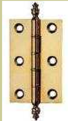
MJK AI B003T Solid Brass Crown Butt Hinge Size : 75 x 19 mm (3" x 3/4") 100 x 19 mm (4" x 3/4")

Just specify us the product number/s, and required size/s for your valued inquiry.