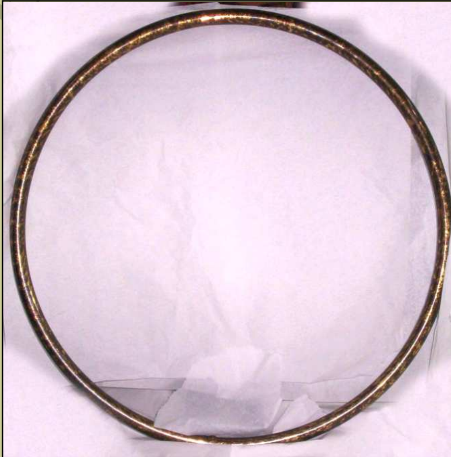
# BSR-1 BAR STOOL RINGS.

MADE IN 18 GAUGE BRASS TUBE, 7/8'' (22 MM) DIAMETER) EVENLY ROUND TURNED, WITHOUT ANY TURNING MARK.